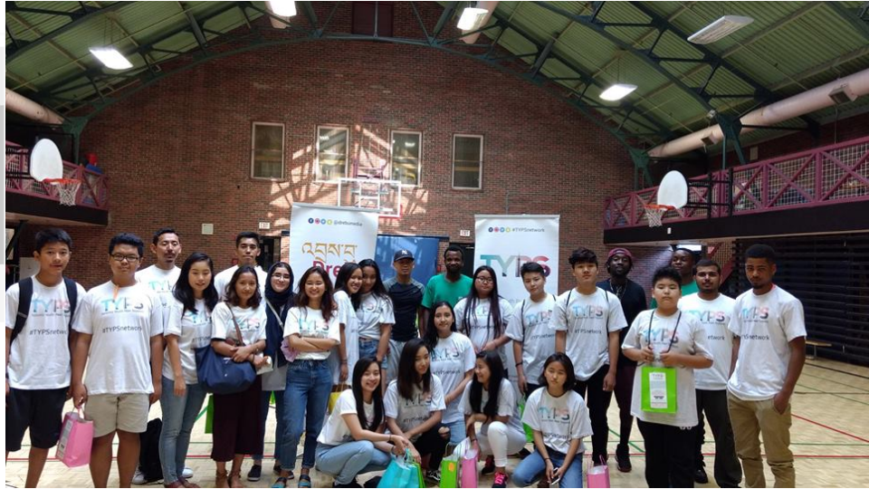
TYPS Network Facebook album